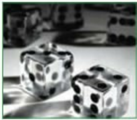
20,000:1 Contrast Ratio