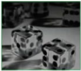
2000:1 Contrast Ratio

Add more depth to your image with a high contrast projector; with brighter whites and ultra-rich blacks, images come alive and text appears crisp and clear - ideal for business and education applications.